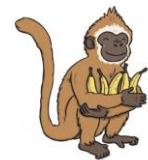
monkey, honey, key, nosy, money, turkey