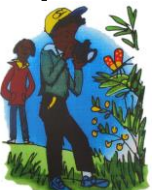
take a photo

trough, alphabet, elephant, nephew, nephew