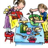
make a cake

3 make, shake, cake, name, same, game, save, brave, late, date