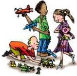
may I play?