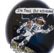
Paul the astronaut

Paul, astronaut, August, author, dinosaur, pause