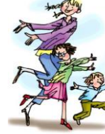
what and twist!