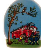
come to the rescue!