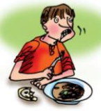
chew the stew

3 new, knew, flew, blew, few, crew, news, screw, drew, grew, stew